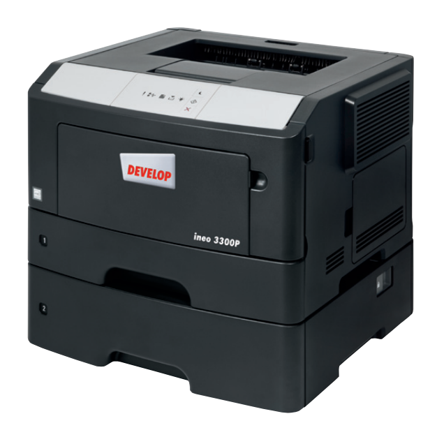
ineo 3300P with additional 550-sheet cassette (PF-P12)

If the operating system on your current printer is frustratingly difficult to follow and the device is difficult to use, it's time you considered switching to an ineo 3300P. Its ease of use will save your and your staff's time and effort in everyday printing jobs. And nobody will have to consult an operating manual before using this new printer.